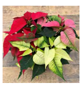
Santa's Table Top 8" Tri Pan.