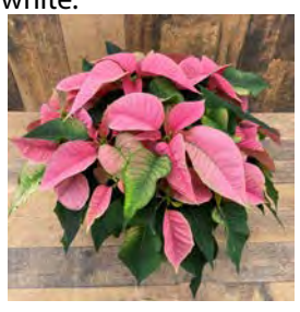
Holiday Blast 8" pot. Available in red, pink, or white.