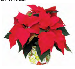
Winter Wonderland 6" pot. Available in red, pink, or white.