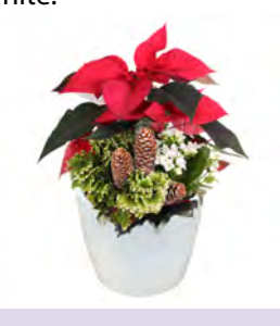
Dasher Festive 6" pot. Available in red, pink, or white.