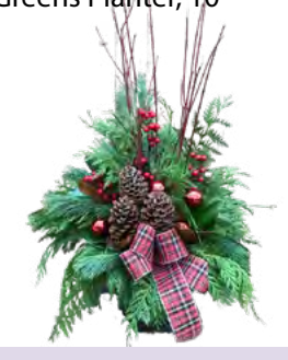
Nature's Blend Outdoor Greens Planter, 10"